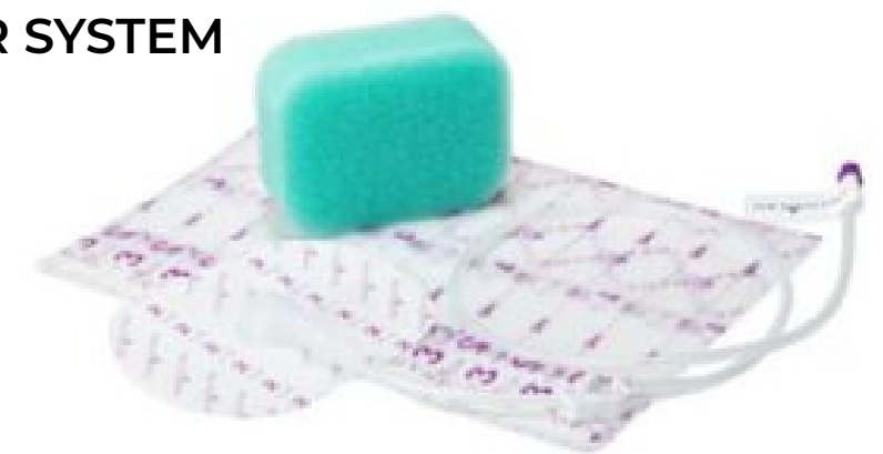
DRESSING KITS (FOAM, SEAL AND TUBING)