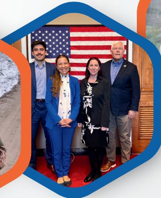
COMMUNITY ADVOCACY AND EDUCATION