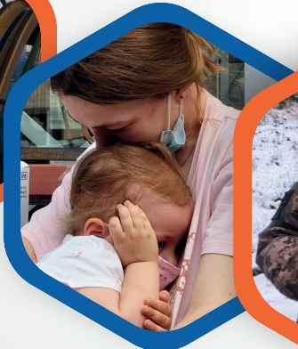
SUPPORT FOR CHILDREN AFFECTED BY THE WAR