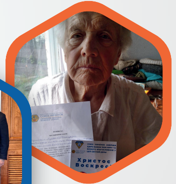
SUPPORT FOR RETIRED WOMEN IN UKRAINE